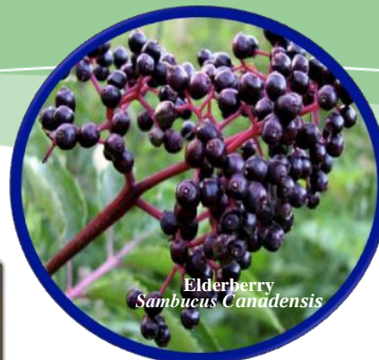
Elderberry Sambucus Canadensis

We are listed on the National Registry of Botanical Plant Sanctuaries. With the help of United Plant Savers we will introduce endangered plants and carefully foster them. We are also a certified Native Plant Habitat through the North Carolina Native Plant Society.