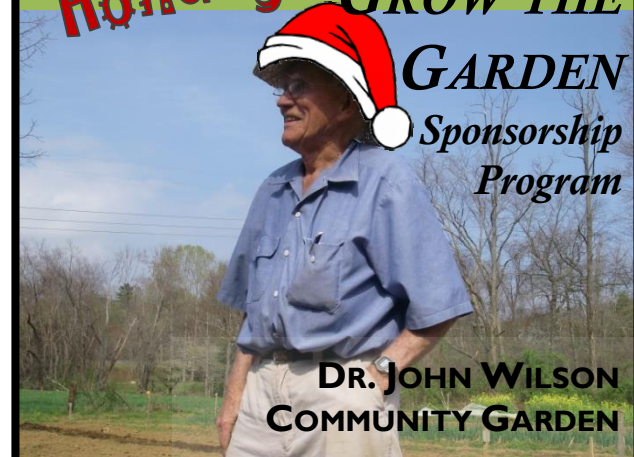
DR. JOHN WILSON COMMUNITY GARDEN

Looking for a Holiday Gift? GROW THE GARDEN Sponsorship Program